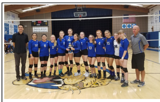
PAA Varsity Volleyball Team

This week, a group of 50 PAA students, teachers, and parents will travel to Walla Walla University to participate in the Fall Classic Sports Tournament. This event is a highlight each year for both volleyball and soccer, and offers