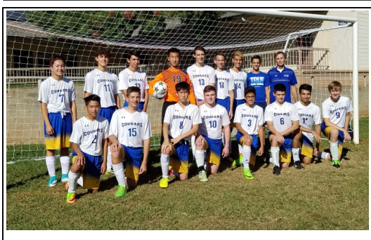
PAA Soccer Team

students an excellent opportunity to build their athletic skills both as individuals and as teams. In addition, it strengthens their friendships with one another and provides opportunities to connections make students from other schools. It also allows the students to visit the WWU campus which has been instrumental in many students' decisions to attend WWU. Finally, Sabbath is a great opportunity to participate Vespers and Church Please pray that Services. these few days will be