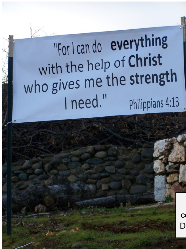
This banner appears on the corner of Pearson and Academy Drive near our original PAC sign.